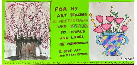
WORK BY PROMISING YOUNG ARTISTS FEATURED IN OUR 2022 VIRTUAL EXHIBITION.